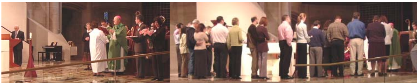
Prayer with parents of children who have died