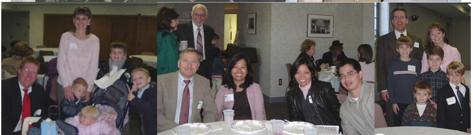
Couples joined in the social gathering after the Mass and expressed their gratitude for God's