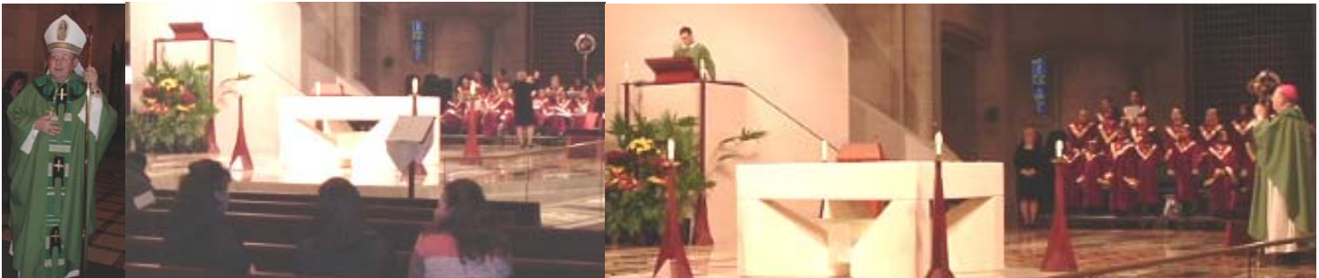
Liturgy of the Word