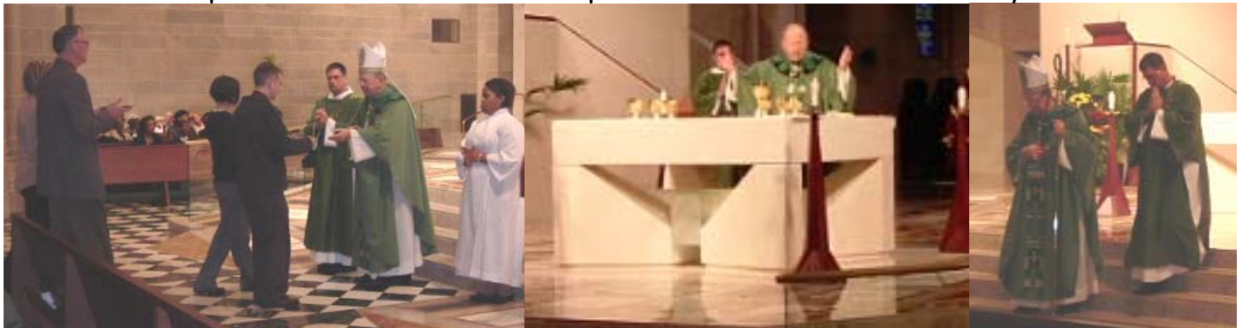
Liturgy of the Word