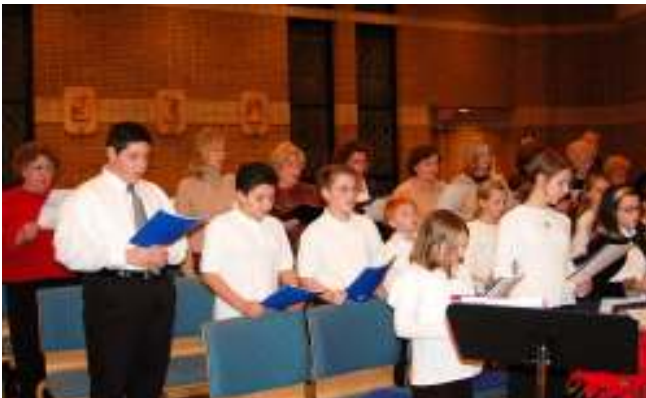
Members of adult and youth choirs from the Vicariate sang at Mass

Planning for this special evening took several months, with members from the various parishes in the vicariate coming together to share their time talent and treasure to oversee and assure a